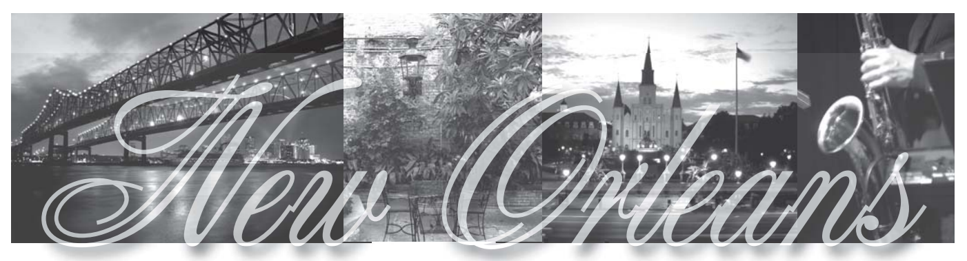
Join online at: www.anpaonline.org