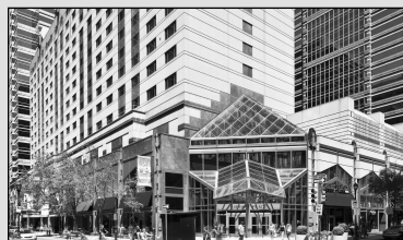
The Westin Philadelphia 99 South 17 th Street at Liberty Place